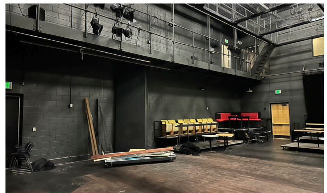
VIEW FROM ACTING AREA OF STUDIO BOOTH WALL