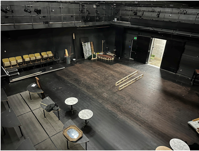
VIEW OF STUDIO FLOOR FROM GALLERY LEVEL