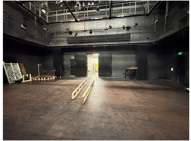
VIEW OF STUDIO UPSTAGE WALL (WITHOUT DRAPES) W/ 10'-0" TALL SCENIC LOADING DOOR

Seating Capacity: 150 (flexible) Acting Area: 24' deep X 42' wide