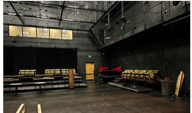
VIEW FROM ACTING AREA OF STUDIO BOOTH WALL